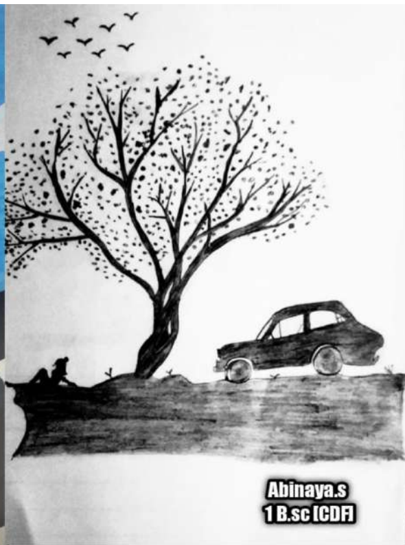
Abinaya.s 1 B.sc ICDF