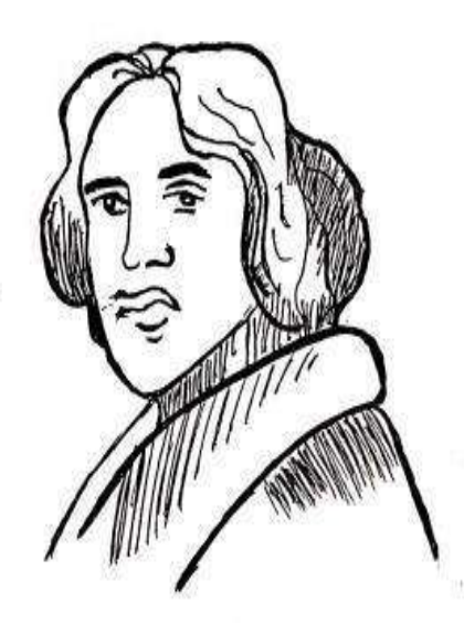
No MAN IS RICH ENOUGH TO BUY BACK HIS PAST."

"WORDS ARE, OF COURSE, THE MOST POWERFUL DRUG USED BY MANKIND."